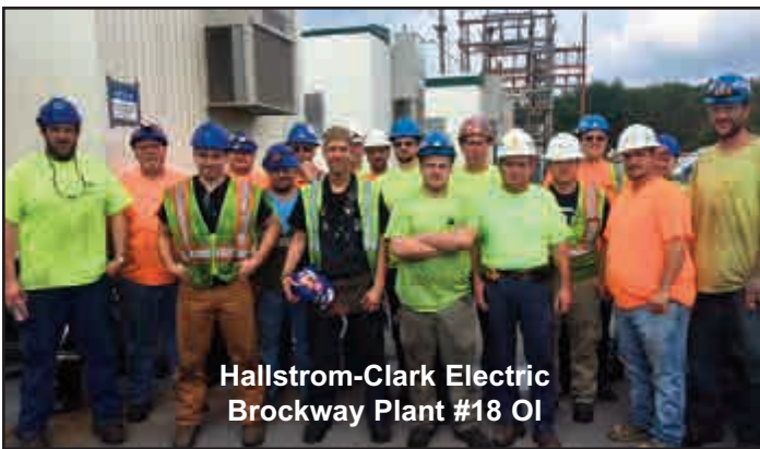
Hallstrom-Clark Electric Brockway Plant #18 OI