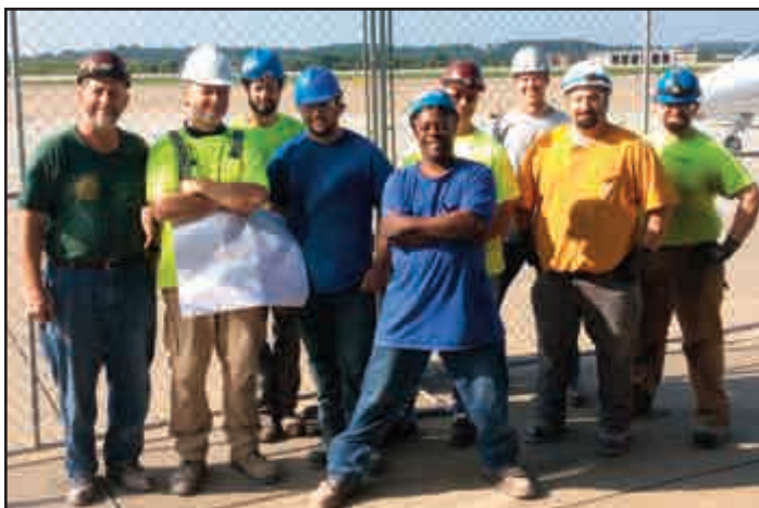
Ferry Electric Company at Atlantic Aviation FBO Pittsburgh