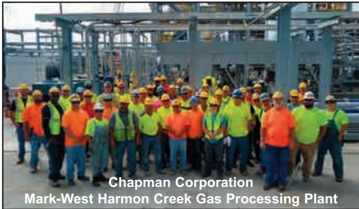
Chapman Corporation Mark-West Harmon Creek Gas Processing Plant