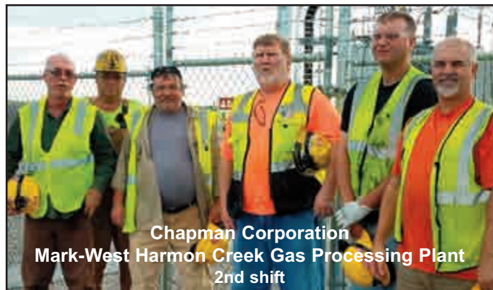
Chapman Corporation Mark-West Harmon Creek Gas Processing Plant 2nd shift

A R O U N D O U R J U R I S D I C T I O N