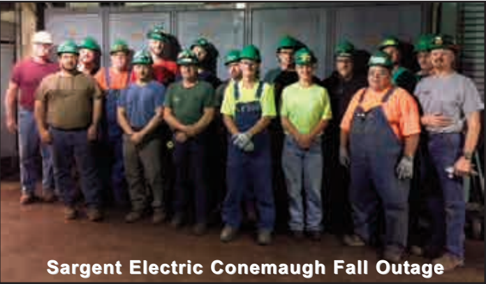
Sargent Electric Conemaugh Fall Outage