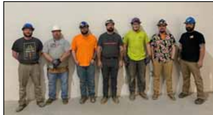
Hallstrom-Clark Electric crew at Oklahoma Elementary School