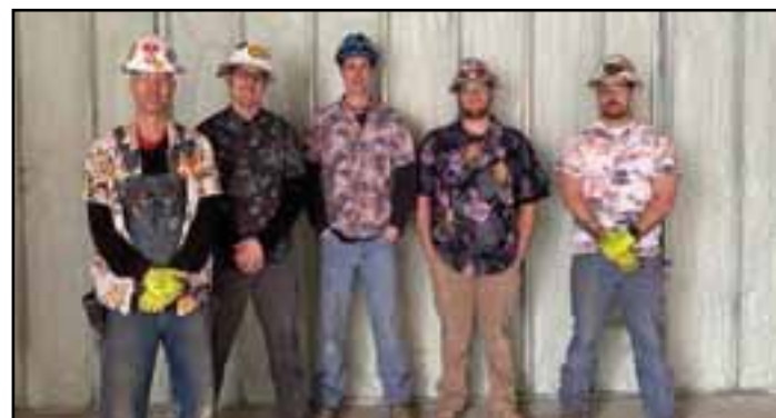
Elco Electric crew at PSU Dubois