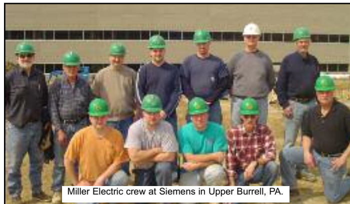
Miller Electric crew at Siemens in Upper Burrell, PA.