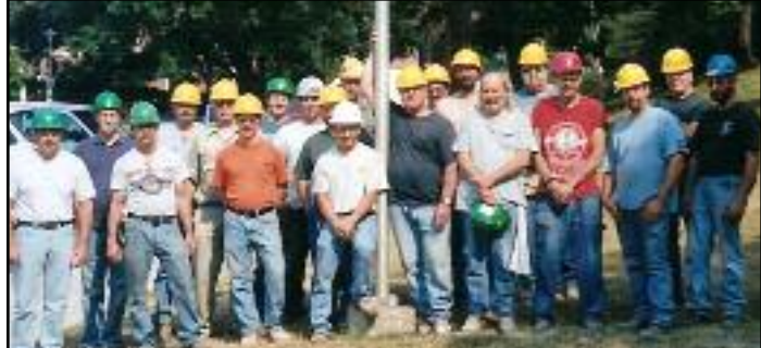
Stelco and Miller Electric Crews at Penn State Fire Alarm Projects