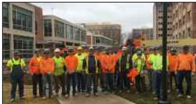
Biter Electric crew at PSU East Halls Project