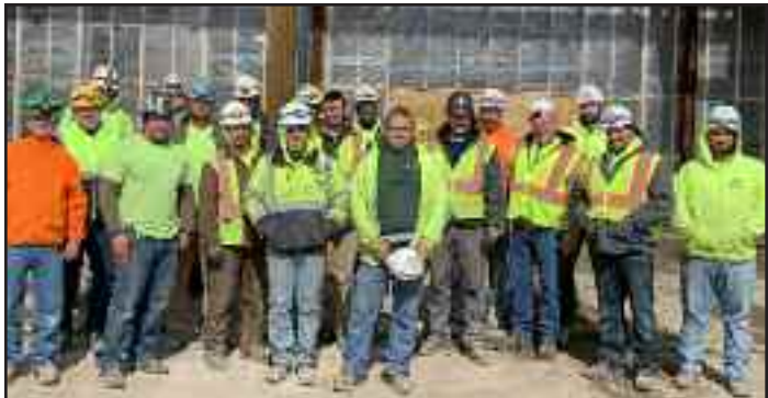
Westmoreland Live Casino Clista Electric