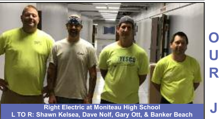
by Ben Steinmeyer