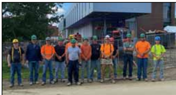
Marsula Electric at University of Pittsburgh at Bradford IT Building