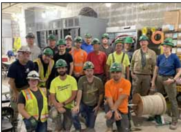
Sargent, Blue Sky, and Imbutec at CMU Forbes and Beeler Residence Hall