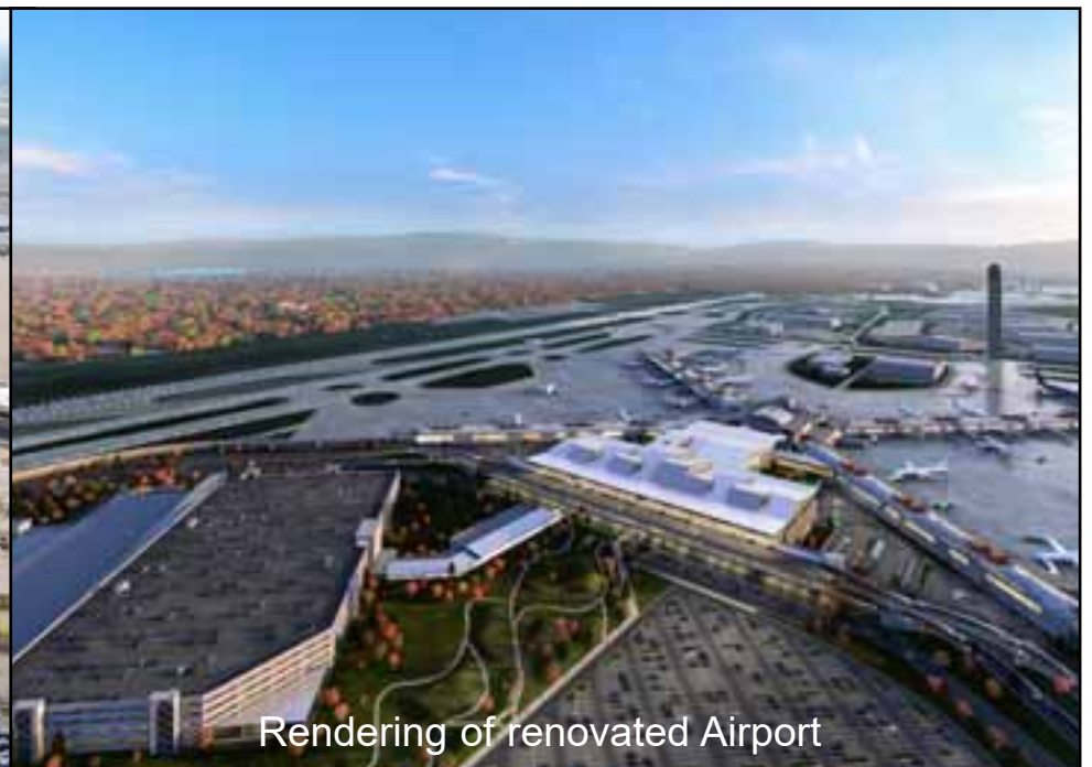
Rendering of renovated Airport

As we reflect on 125 amazing years in Local 5 it's hard to escape the old adage, history repeats itself. Looking back to 1992, Pittsburgh International Airport opened its doors after nearly 5 years of construction on a 10,000-acre site, becoming one of the most advanced civilian/military airports in the world and creating thousands of jobs. And so Local 5 stands, once again, with our friends at the Allegheny County Airport Authority for the construction of the country's most advanced airport. Pittsburgh's new $1.4 billion, 700,000 square foot terminal project. This project will focus on public health, technology, including clean air technology, more space for social distancing, 90,000 square feet of outdoor terrace space accessible both before and after security check-ins.