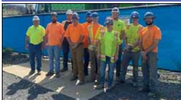
Biter Electric at PSU Art Museum at the Arboretum