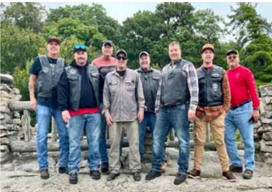
2022 Motorcycle Club Ride at Coopers Rock WV.