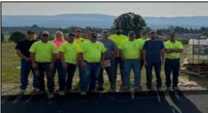
Tri-City Electric crew at Ascent Health