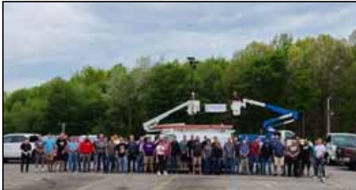
Right Electric Annual Safety Meeting