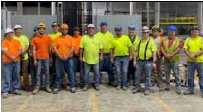
Bettwy Electric Crew at DelGrosso Sauce addition

A R O U N D O U R J U R I S D I C T I O N