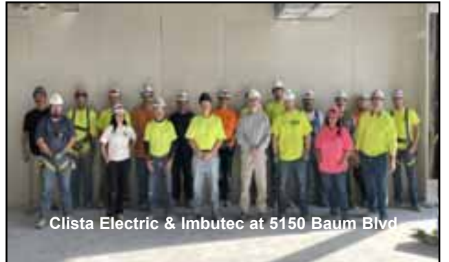
Clista Electric & Imbutec at 5150 Baum Blvd