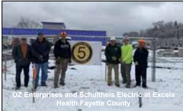
OZ Enterprises and Schultheis Electric at Excelsa Health Fayette County