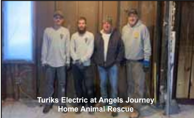
Turiks Electric at Angels Journey Home Animal Rescue