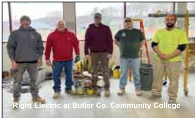
Right Electric at Butler Co. Community College