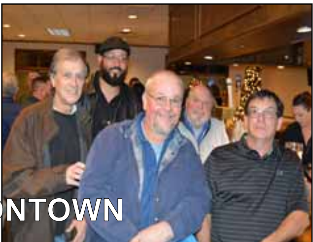
CHRISTMAS PARTY IN UNIONTOWN