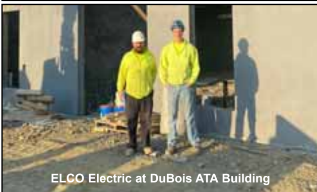
ELCO Electric at DuBois ATA Building