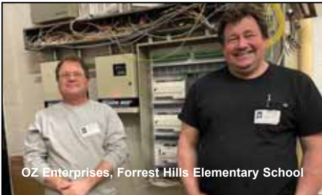
OZ Enterprises, Forrest Hills Elementary School