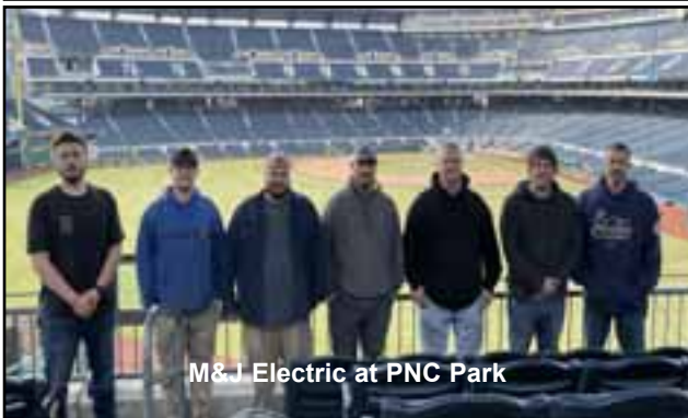
M&J Electric at PNC Park