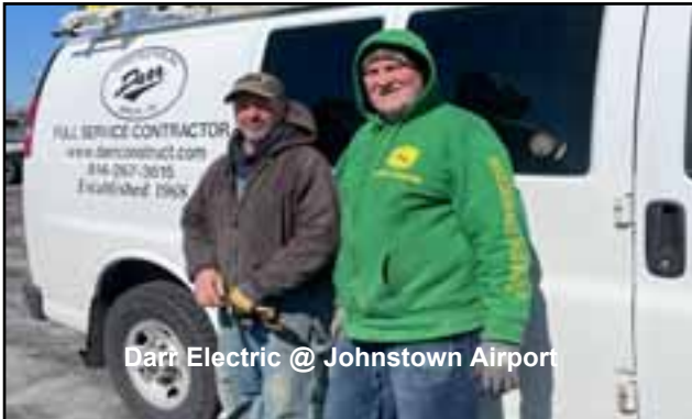
Darr Electric @ Johnstown Airport