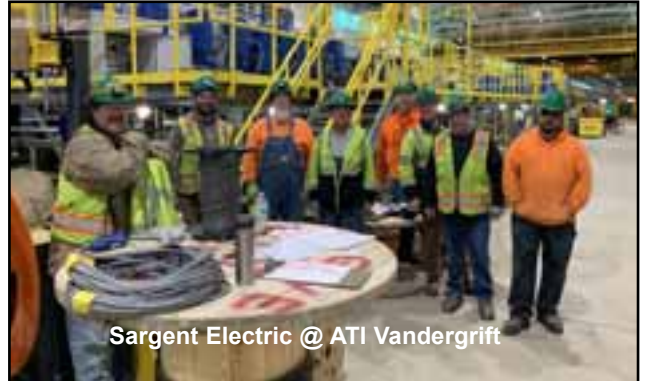
Sargent Electric @ ATI Vandergriff