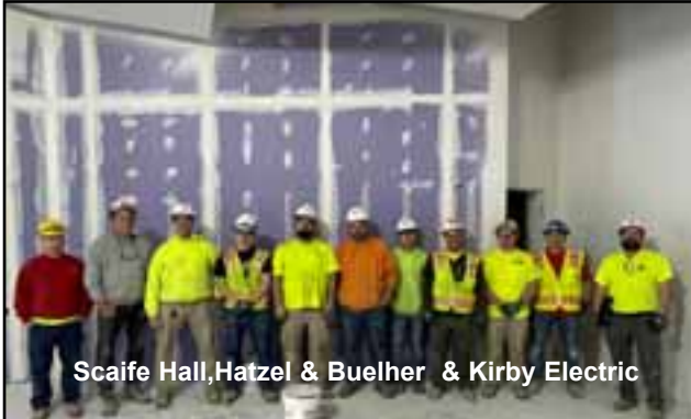
Scaife Hall, Hatzel & Buelher & Kirby Electric