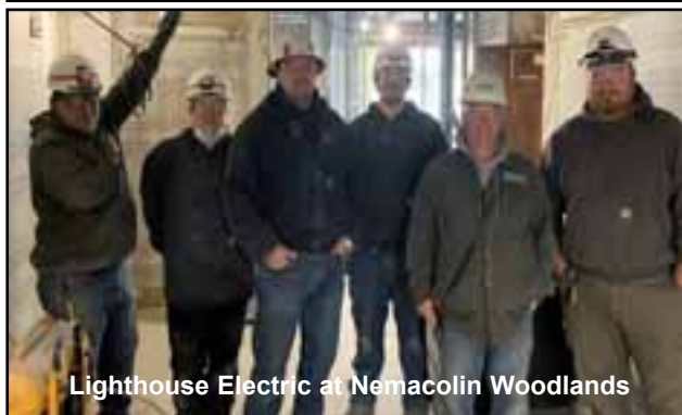
Lighthouse Electric at Nemaocolin Woodlands