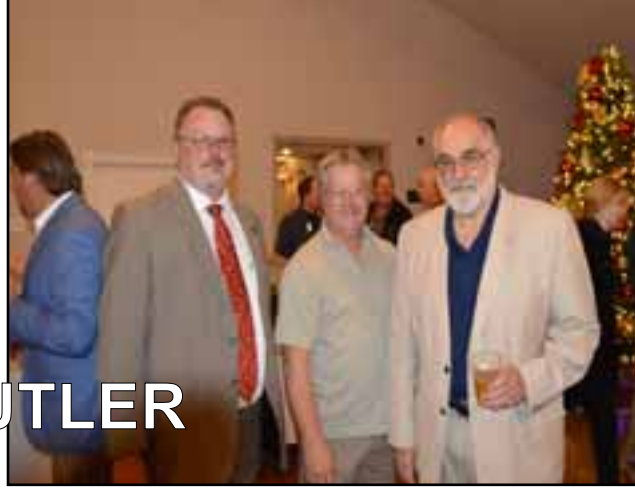
CHRISTMAS PARTY IN BUTLER