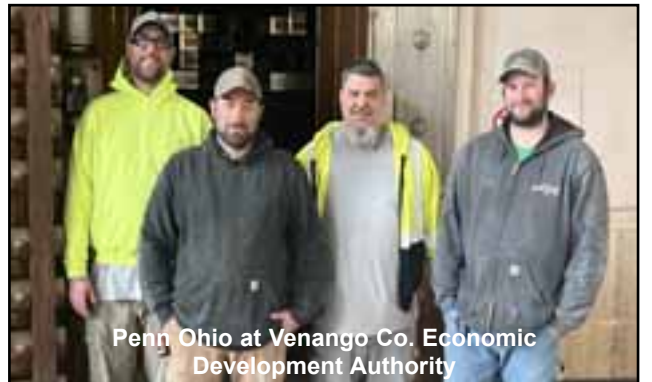
Penn Ohio at Venango Co. Economic Development Authority