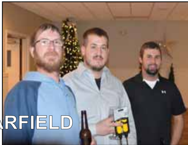
CHRISTMAS PARTY IN CLEARFIELD