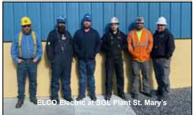
ELCO Electric at SGL Plant St. Mary's