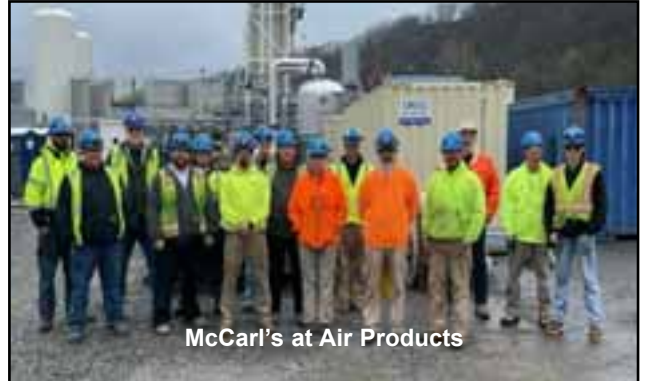
McCarl's at Air Products