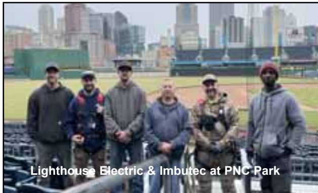
Lighthouse Electric & Imbutec at PNC Park