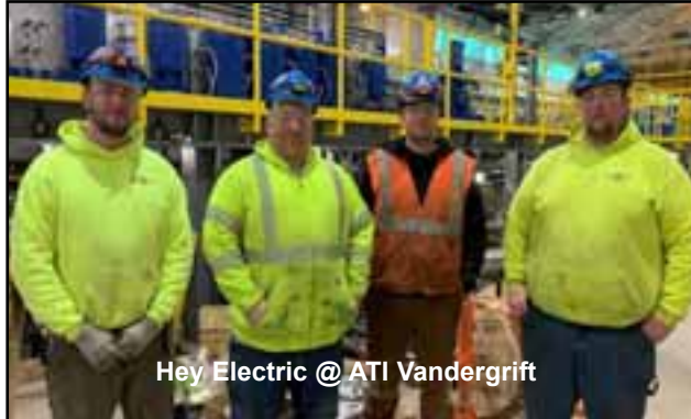
Hey Electric @ ATI Vandergriff