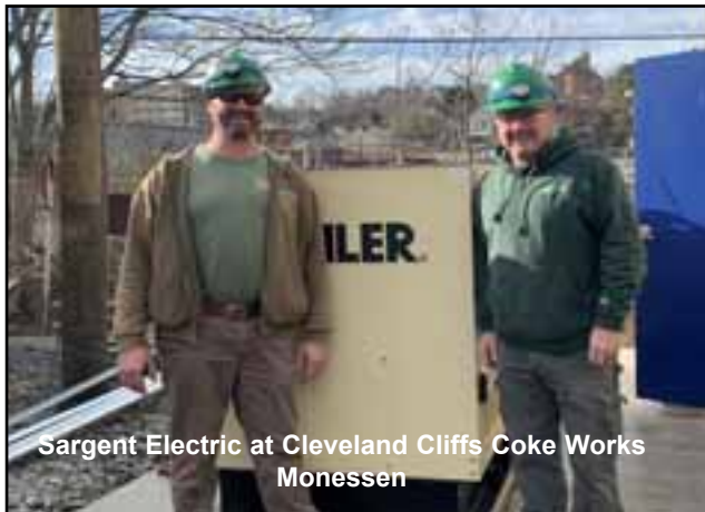
Sargent Electric at Cleveland Cliffs Coke Works Monessen