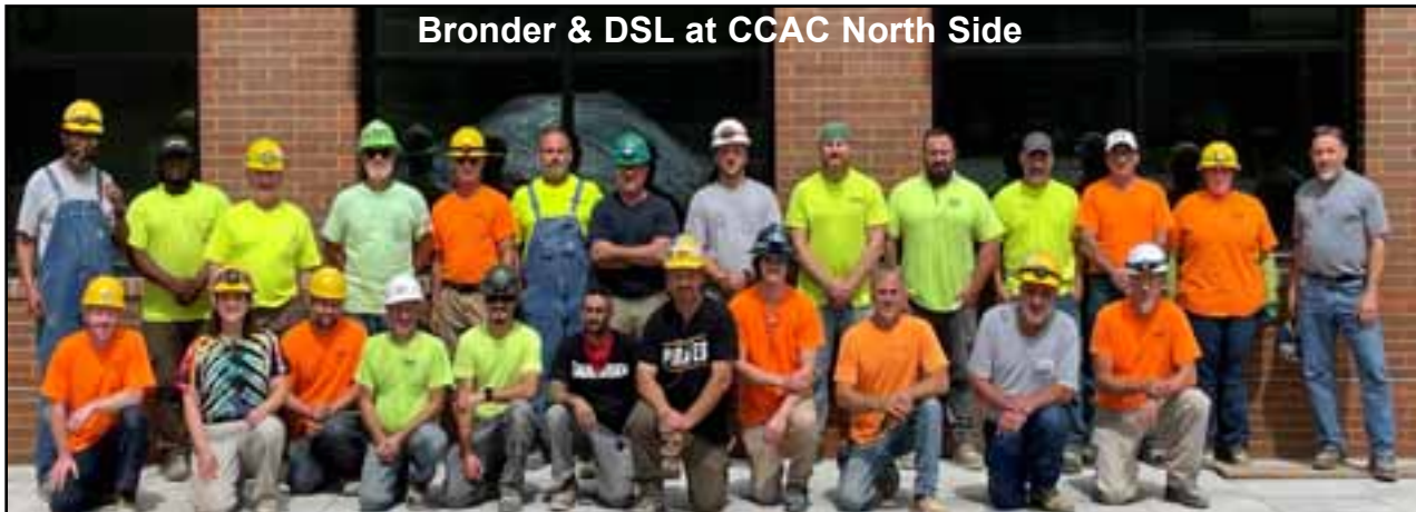
Bronder & DSL at CCAC North Side