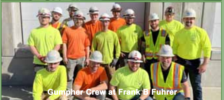
Gumpher Crew at Frank B Fuhrer