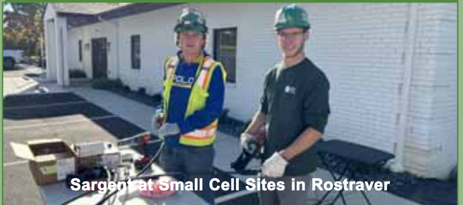
Sargent at Small Cell Sites in Rostraver