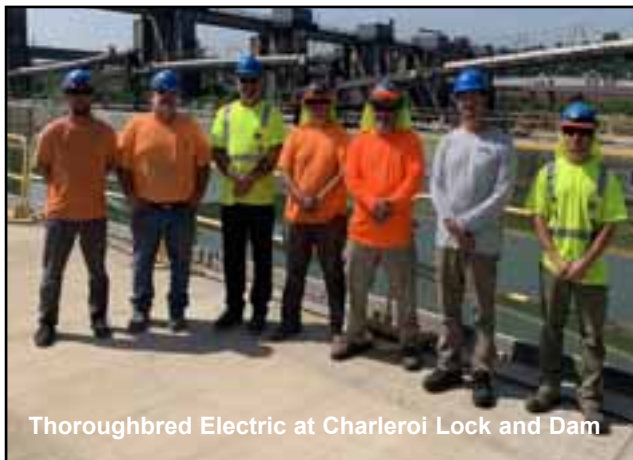
Thoroughbred Electric at Charleroi Lock and Dam