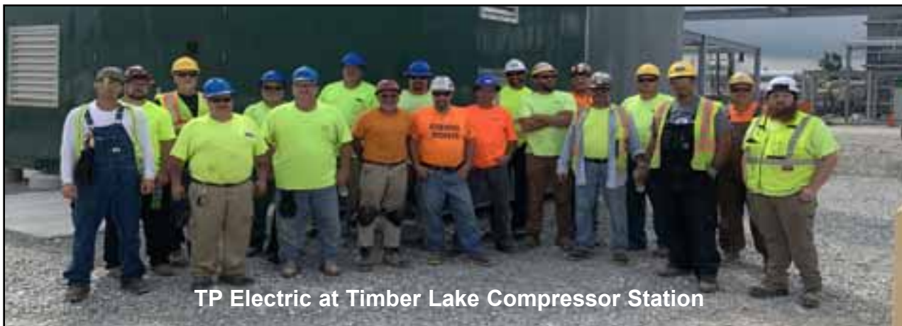
TP Electric at Timber Lake Compressor Station