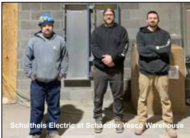
Schultheis Electric at Schaedler Yesco Warehouse