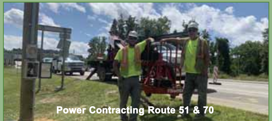
Power Contracting Route 51 & 70